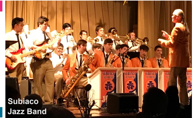
Subiaco Jazz Band