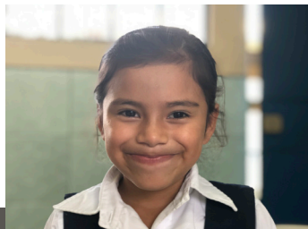
Above: The youngest scholar in the G.E.M. program takes a break from studies for smiles.