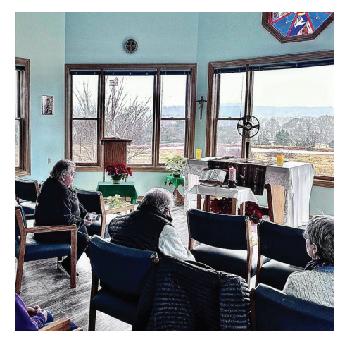
Oblates spent time in contemplation in the chapel.

Around noon, they gathered to pray the liturgy of the hours, after which they enjoyed a simple lunch and visit with the Sisters. The remaining hours of the reflection day were spent in solitude with the Lord, culminating in a prayer service where they shared some of their insights from the day.