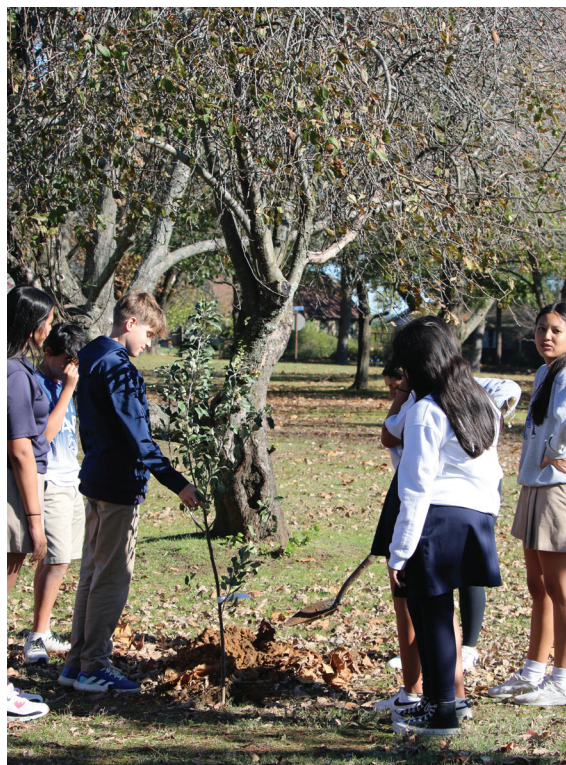
Earth Club students dig a hole for the new apple tree.