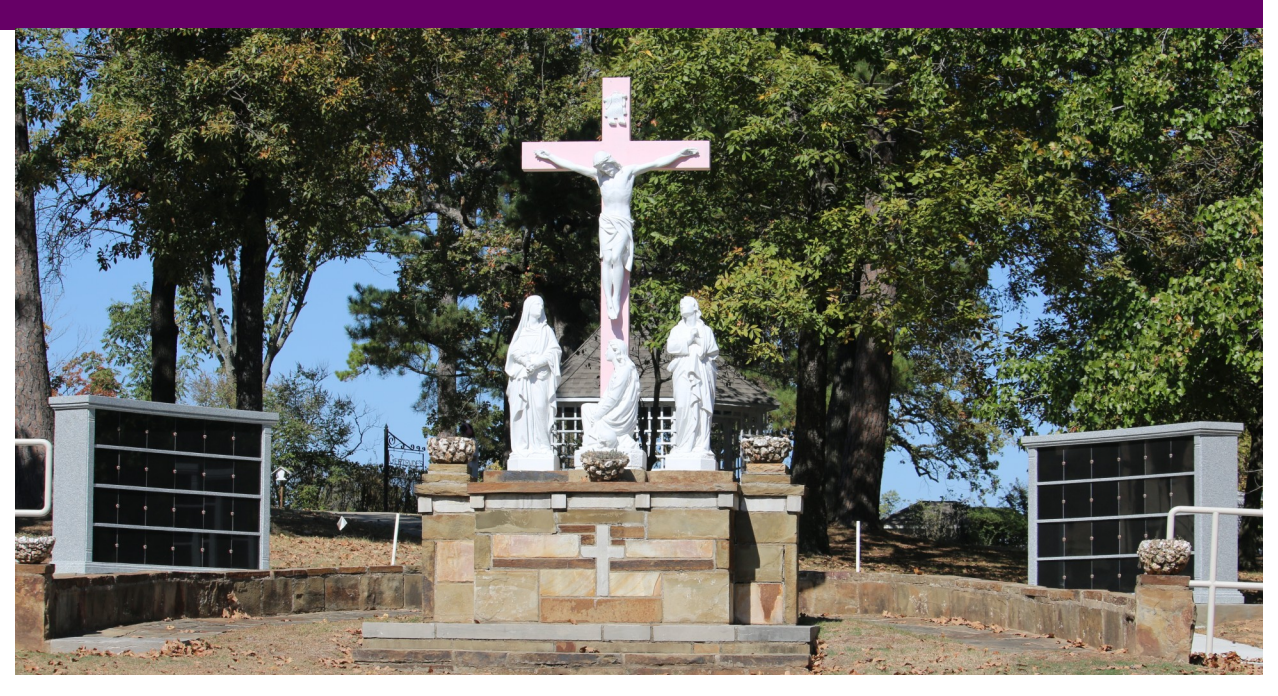
{\it Columbarium\ view\ from\ South\ looking\ North.}

St. Scholastica Monastery will assign a niche if location is not selected by the purchaser.