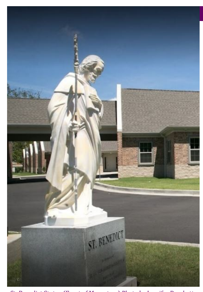
St. Benedict Statue (Front of Monastery)