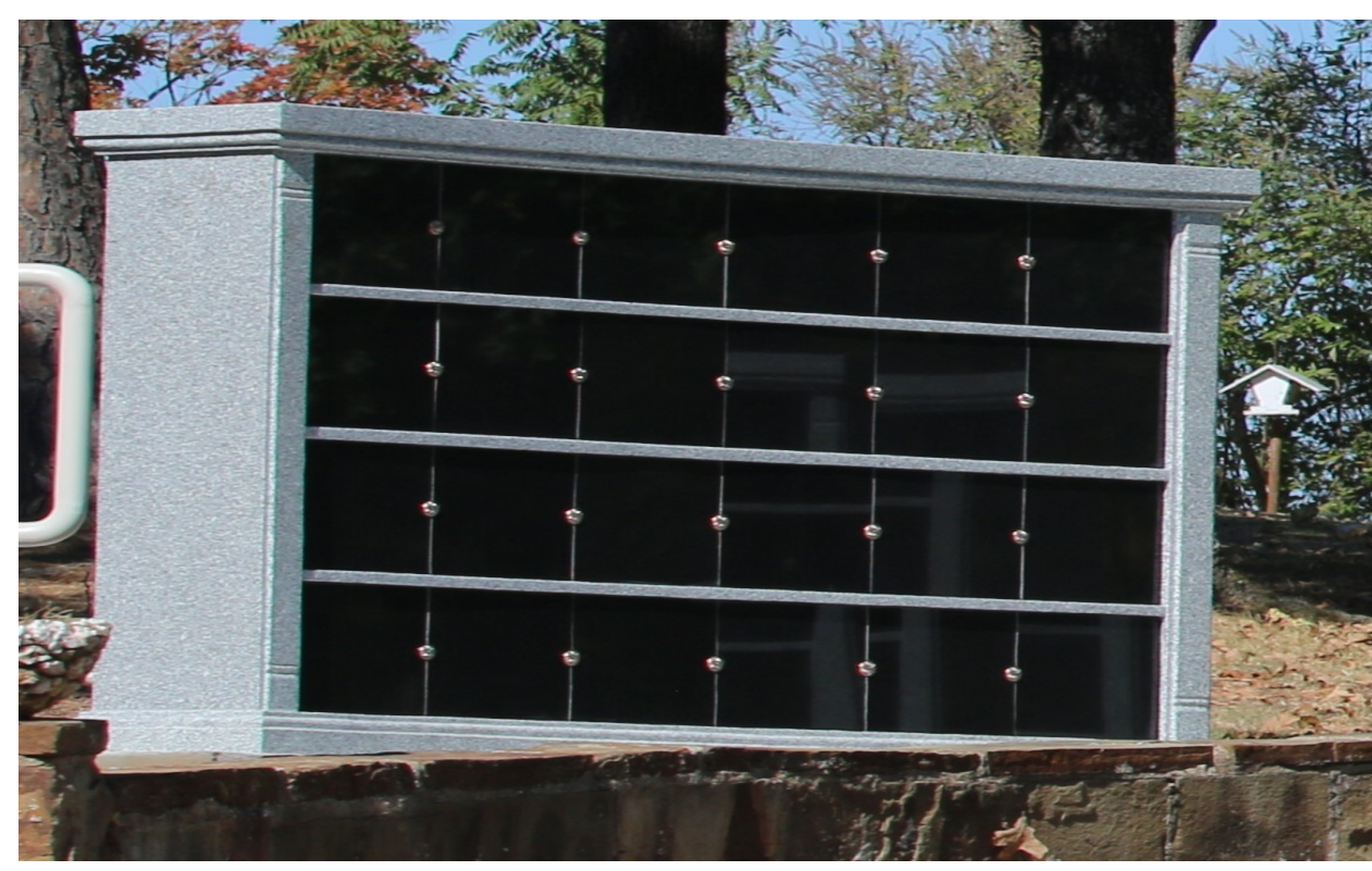
West Columbarium